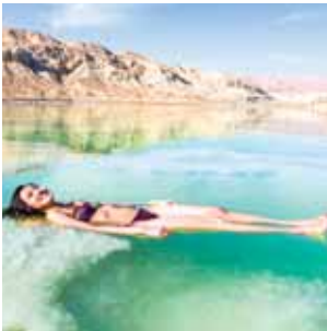
DEAD SEA, ISRAEL