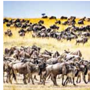
MASAI MARA, KENYA