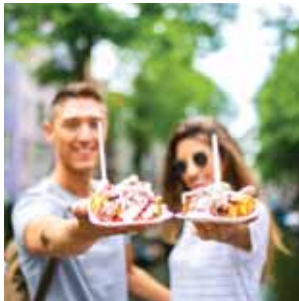
AMSTERDAM, NETHERLANDS @contiki