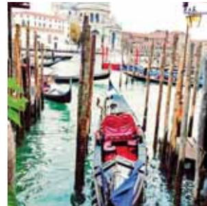
VENICE, ITALY @rachel_marie_304