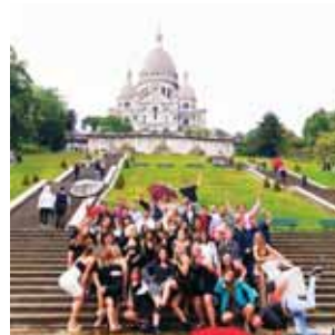
PARIS, FRANCE @loz_gray