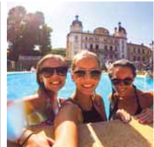
CONTIKI CHÂTEAU, FRANCE @sabrina_merkl