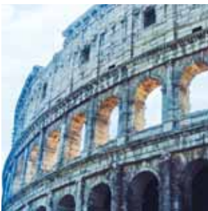
ROME, ITALY @minaapark