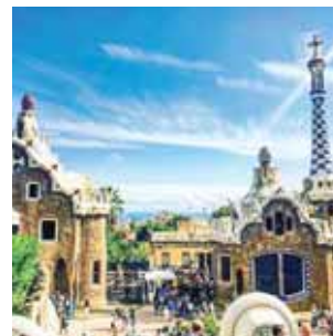
BARCELONA, SPAIN @graceelouise__