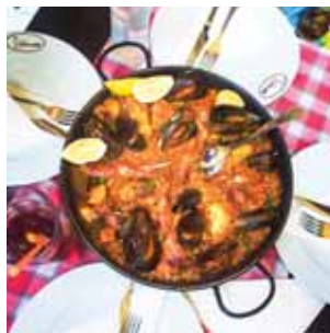
BARCELONA, SPAIN @kaylamaree1993