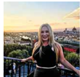
FLORENCE, ITALY