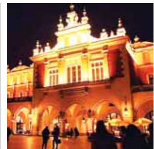
KRAKOW, POLAND @lozzymiles