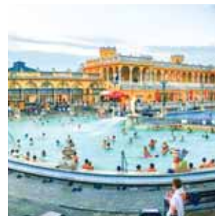
BUDAPEST, HUNGARY @morgyramsay