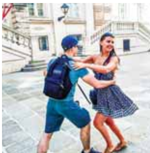
VIENNA, AUSTRIA @allyperpick