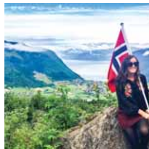
VOSS, NORWAY @live.to.travel