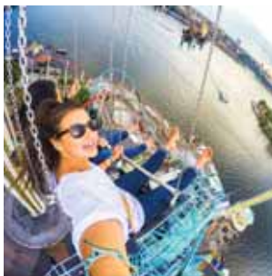
STOCKHOLM, SWEDEN @miraecampbell