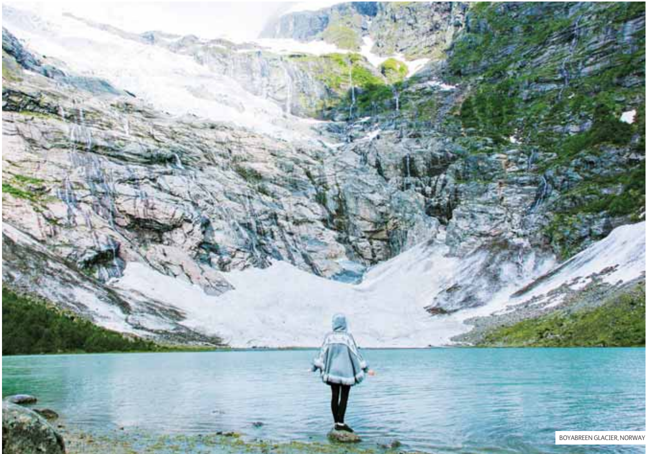
BOYABREEN GLACIER, NORWAY