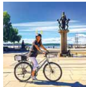
OSLO, NORWAY @brittless