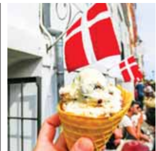
COPENHAGEN, DENMARK